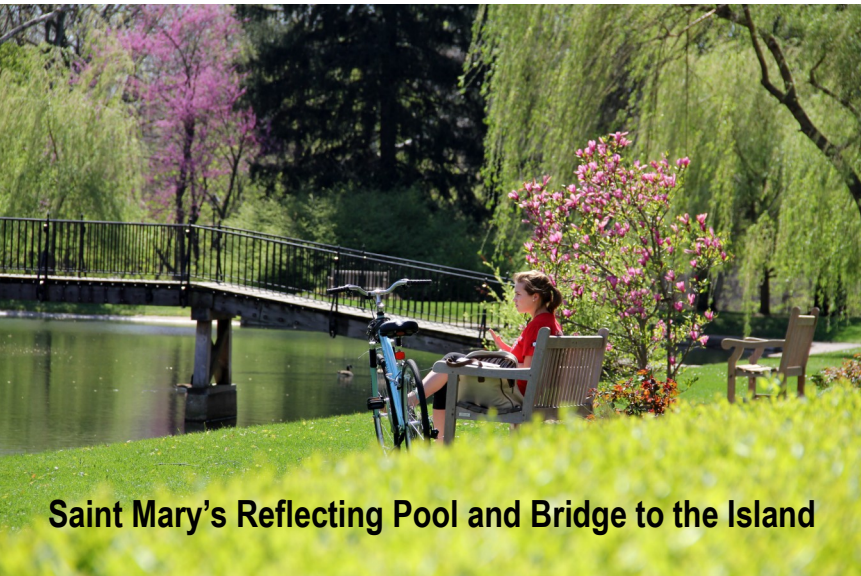
Saint Mary's Reflecting Pool and Bridge to the Island